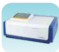
UV/VIS Spectro 2080+ Double Beam

Analytical Technologies is synonymous for offering technologies for doing analysis and is the Fastest Growing Global Brand having presence in at least 96 countries across the global. Analytical Technologies Limited is an ISO:9001 Certified Company engaged in Designing, Manufacturing, Marketing & providing Services for the Analytical, Chromatography, Spectroscopy, Bio Technology, Bio Medical, Clinical Diagnostics, Material Science & General Laboratory Instrumentation. Analytical Technologies, India has across the Country operations with at least 4 Regional Offices, 6 Branch Offices & Service Centers. Distributors & Channel partners worldwide.